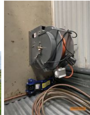
Outside Entry 1 - Estate of Spencer