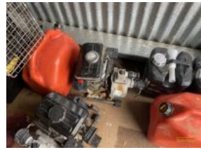
Outside Entry 1 - Estate of Spencer