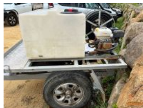
Outside Entry 2 - CJ Environmental Pty Ltd