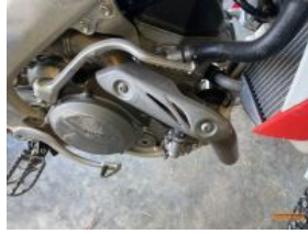
Outside Entry 1 - Estate of Spencer