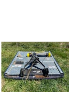
Outside Entry 1 - Estate of Spencer