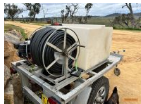
Outside Entry 2 - CJ Environmental Pty Ltd