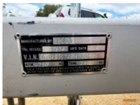
Outside Entry 2 - CJ Environmental Pty Ltd