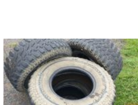
Outside Entry 3 - D Macpherson