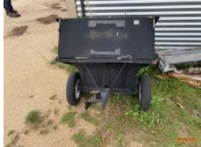
Outside Entry 1 - Estate of Spencer