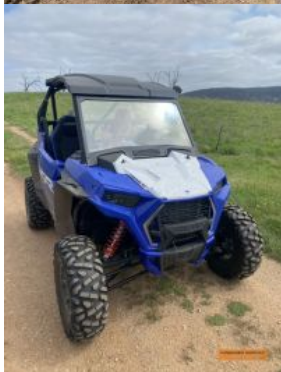
Outside Entry 1 - Estate of Spencer