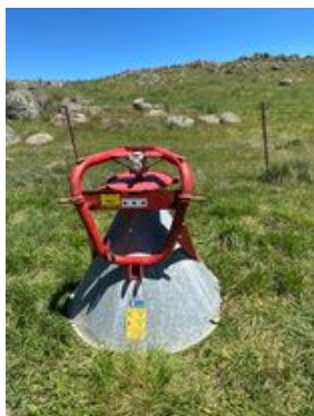
Outside Entry 1 - Estate of Spencer