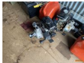
Outside Entry 1 - Estate of Spencer