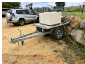
Outside Entry 2 - CJ Environmental Pty Ltd