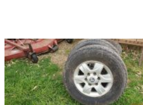
Outside Entry 3 - D Macpherson