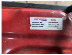
Outside Entry 1 - Estate of Spencer