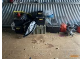
Outside Entry 1 - Estate of Spencer