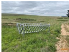
Outside Entry 1 - Estate of Spencer