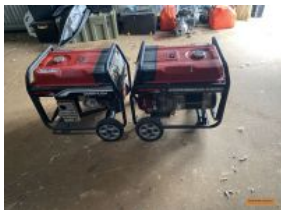
Outside Entry 1 - Estate of Spencer