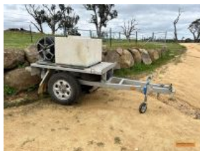
Outside Entry 2 - CJ Environmental Pty Ltd