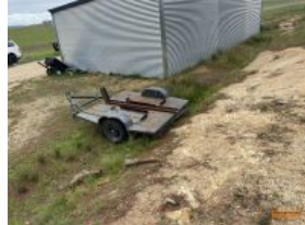
Outside Entry 1 - Estate of Spencer