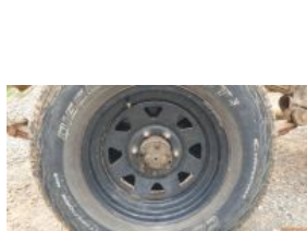
Outside Entry 3 - D Macpherson