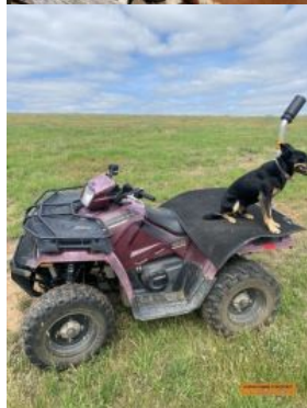
Outside Entry 1 - Estate of Spencer