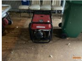
Outside Entry 1 - Estate of Spencer