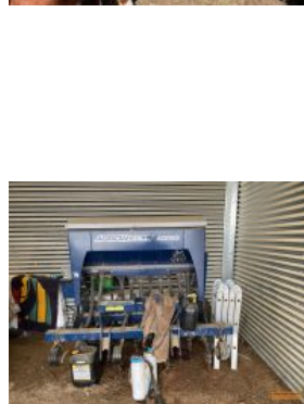
Outside Entry 1 - Estate of Spencer