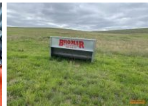
Outside Entry 1 - Estate of Spencer