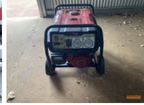
Outside Entry 1 - Estate of Spencer