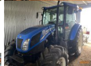
Outside Entry 1 - Estate of Spencer