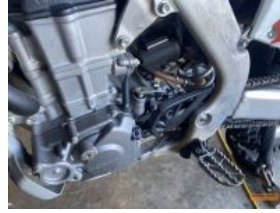
Outside Entry 1 - Estate of Spencer