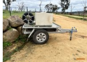
Outside Entry 2 - CJ Environmental Pty Ltd