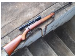
Outside Entry - Ian Evans