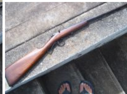
Outside Entry - Ian Evans