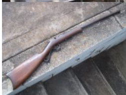
Outside Entry - Ian Evans