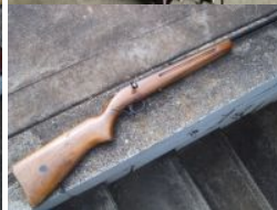
Outside Entry - Ian Evans