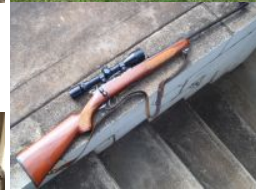
Outside Entry - Ian Evans