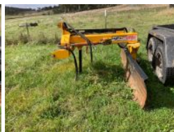
Outside Entry - R & W Crowe