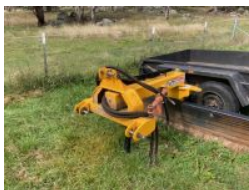
Outside Entry - R & W Crowe