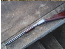
Outside Entry - Ian Evans