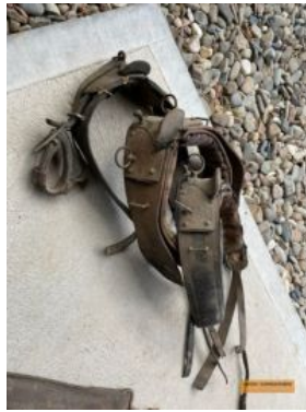
Outside Entry 1 - B Walder