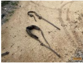
Outside Entry 1 - B Walder