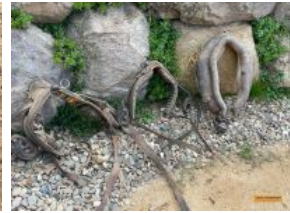
Outside Entry 1 - B Walder