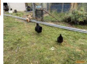
Outside entry 2- A.Brass