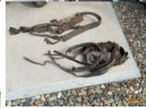
Outside Entry 1 - B Walder