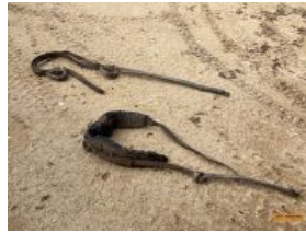
Outside Entry 1 - B Walder