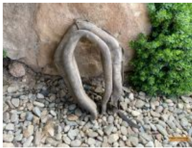
Outside Entry 1 - B Walder