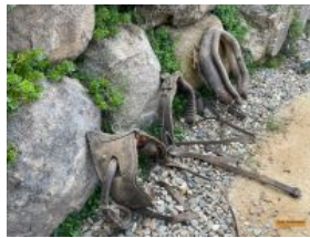
Outside Entry 1 - B Walder