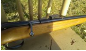
Outside Entry 3 - R Haynes