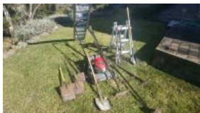
Outside Entry 1 - I Litchfield