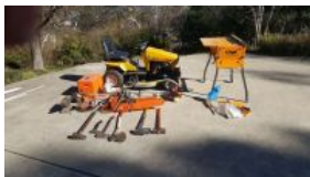
Outside Entry 1 - I Litchfield