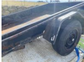
Outside entry 2- M Bieder