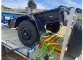
Outside entry 2- M Bieder