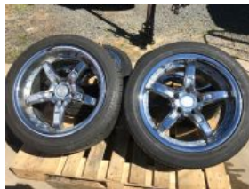
Outside Entry - 4