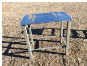
Outside Entry - 5