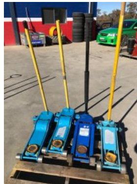
Outside Entry - 4