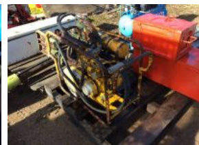
Outside Entry - 1