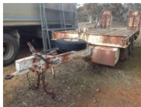
Outside Entry - 1