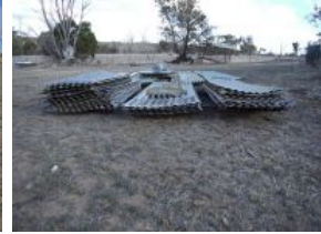
Outside Entry - 7