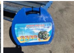
Outside Entry - 4