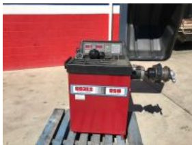
Outside Entry - 4