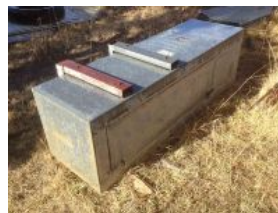
Outside Entry - 1