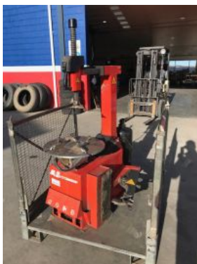
Outside Entry - 4