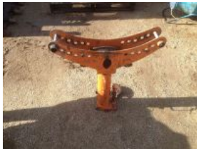
Outside Entry - 1