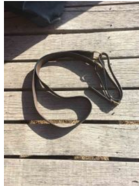
Outside Entry - 2