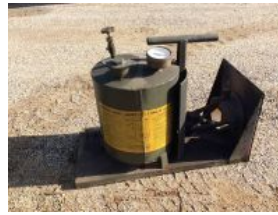
Outside Entry - 1