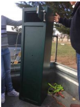
Outside Entry - 2