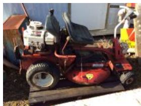
Outside Entry - 1