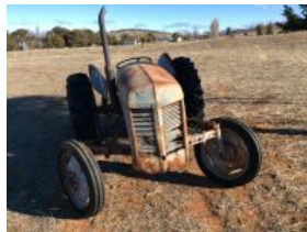
Outside Entry - 3