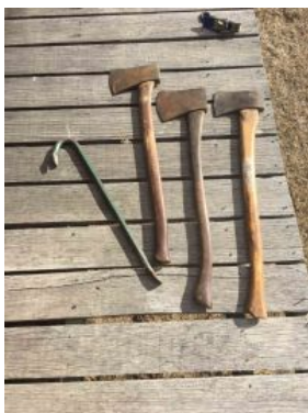
Outside Entry - 2