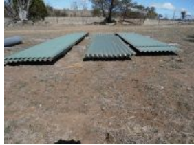
Outside Entry - 7