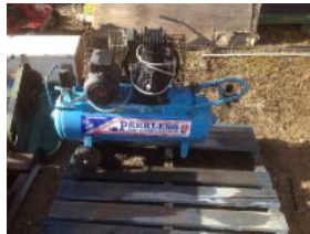
Outside Entry - 1