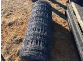
Outside Entry - 5