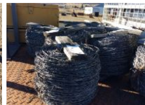
Outside Entry - 5