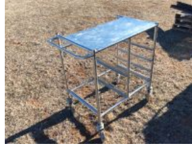
Outside Entry - 5