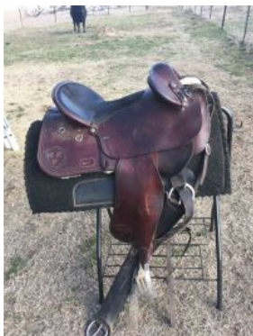
Outside Entry - 2