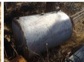
Outside Entry - 1