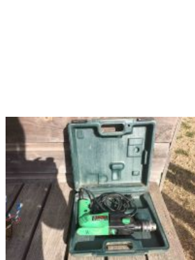
Outside Entry - 2