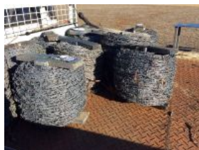
Outside Entry - 5