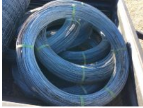
Outside Entry - 5