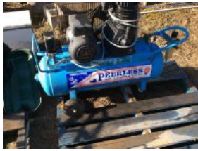
Outside Entry - 1