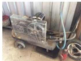
Outside Entry - 1