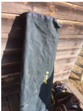
Outside Entry - 2