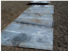
Outside Entry - 7