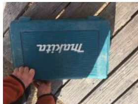
Outside Entry - 2