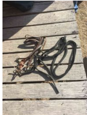
Outside Entry - 2