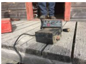
Outside Entry - 2