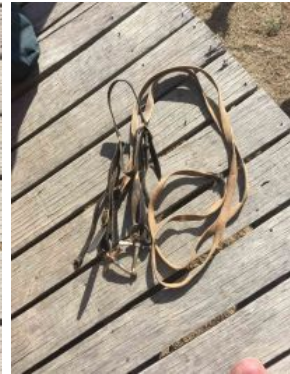
Outside Entry - 2