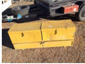
Outside Entry - 5