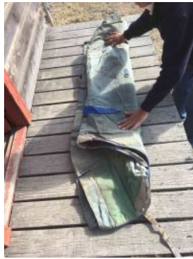
Outside Entry - 2