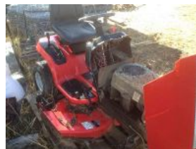
Outside Entry - 1