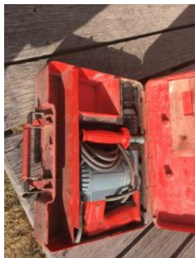
Outside Entry - 2