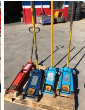
Outside Entry - 4