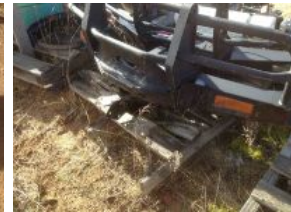
Outside Entry - 1