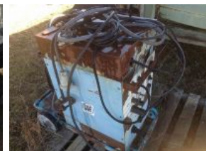
Outside Entry - 1