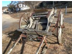
Outside Entry - 1