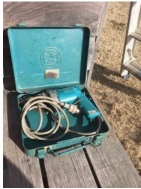
Outside Entry - 2