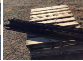
Outside Entry - 5