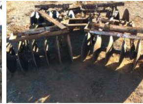
Outside Entry - 3