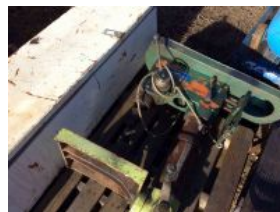
Outside Entry - 1