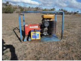
Outside Entry - 7