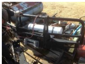
Outside Entry - 1