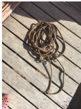
Outside Entry - 2