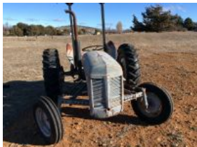
Outside Entry - 3