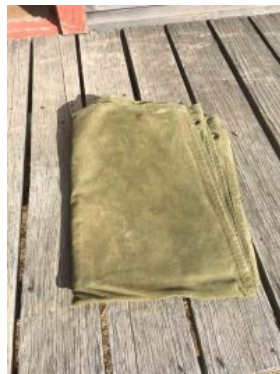
Outside Entry - 2