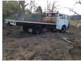
Outside Entry - 3