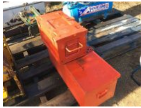
Outside Entry - 1