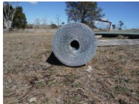
Outside Entry - 7