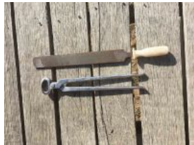
Outside Entry - 2