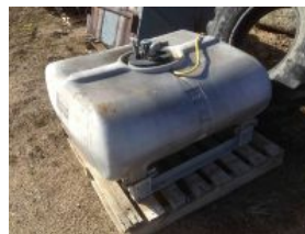
Outside Entry - 1