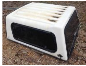
Outside Entry - 1