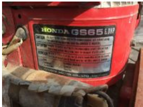
Outside Entry - 2