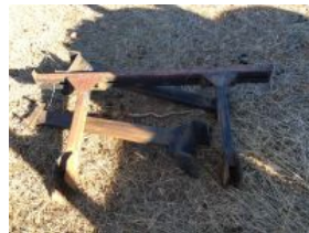
Outside Entry - 3