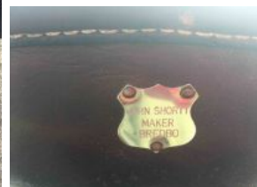
Outside Entry - 2