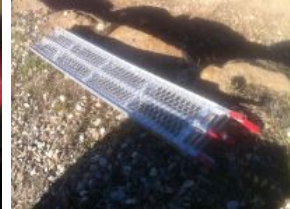
Outside Entry - 2