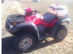
Outside Entry - 2