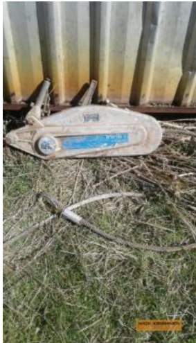
Outside Entry 5 - GM & SM Williams