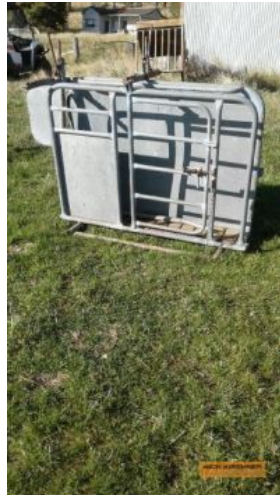
Outside Entry 5 - GM & SM Williams