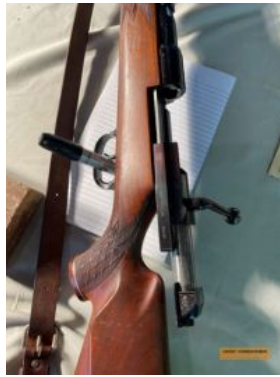
Outside Entry 1 - P Fischer