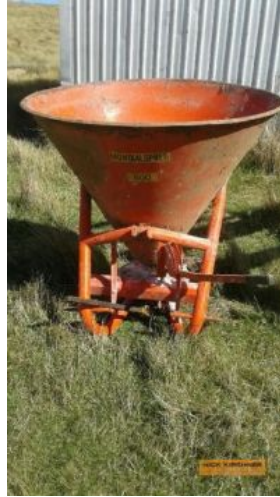
Outside Entry 5 - GM & SM Williams