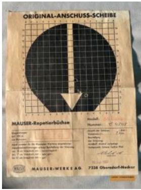
Outside Entry 1 - P Fischer