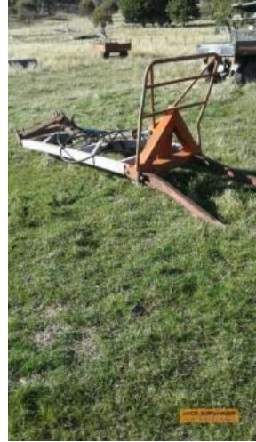
Outside Entry 5 - GM & SM Williams