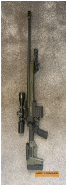
Outside Entry 4 - J Maloney