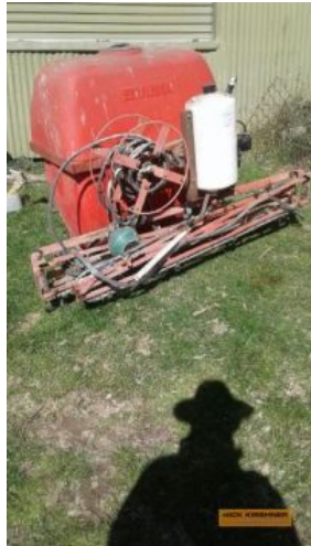
Outside Entry 5 - GM & SM Williams