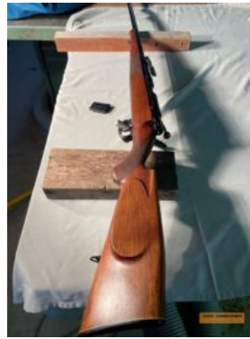
Outside Entry 1 - P Fischer