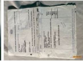
Outside Entry 1 - P Fischer