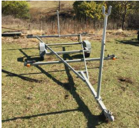
Lot: CLEARING SALE ITEM | Boat Trailer