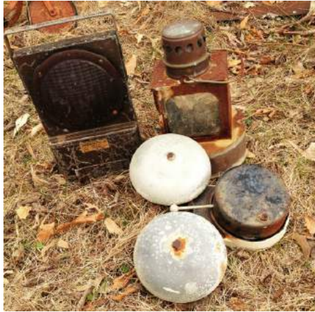
Lot: CLEARING SALE ITEM | Railway Memorabilia