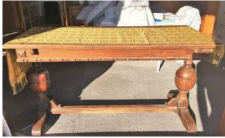
Lot: CLEARING SALE ITEM | Antique Extendable Table