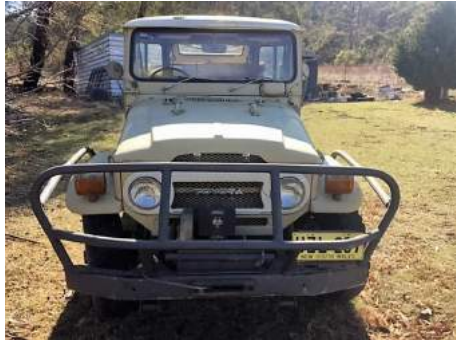
Lot: CLEARING SALE ITEM | Toyota Landcruiser Wagon