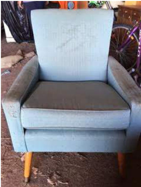
Lot: OUTSIDE ENTRY | MCFARLAND Fabric Armchair