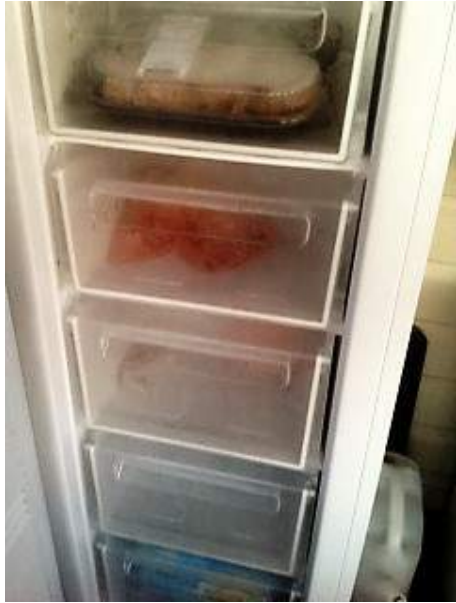
Lot: OUTSIDE ENTRY | P & H. HIGGINS Westinghouse Upright Freezer (image 3)