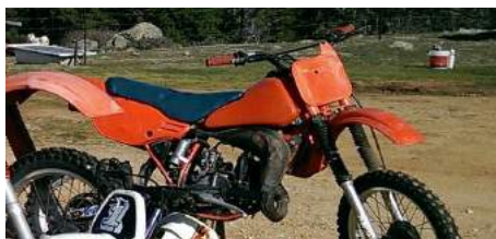
Lot: OUTSIDE ENTRY | MACPHERSON 1983 Honda CR80 (water-cooled)