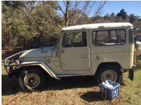
Lot: CLEARING SALE ITEM | Toyota Landcruiser Wagon