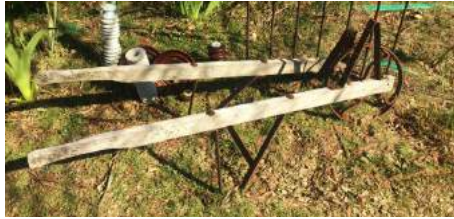
Lot: CLEARING SALE ITEM | Antique Farm Machinery