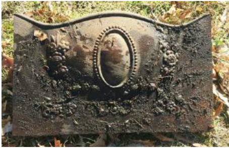
Lot: CLEARING SALE ITEM |