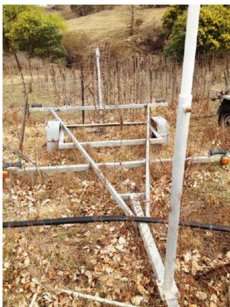
Lot: CLEARING SALE ITEM | Boat Trailer