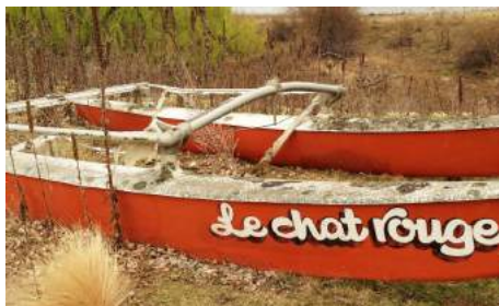
Lot: CLEARING SALE ITEM |