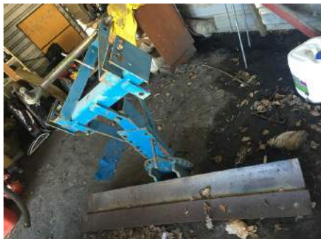
Lot: CLEARING SALE ITEM | Berrends Tractor Blade