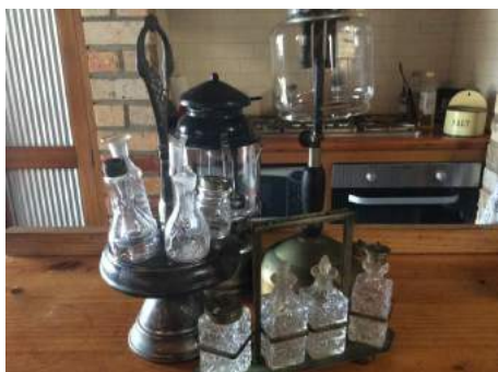
Lot: CLEARING SALE ITEM | Old Lanterns & Cruet Sets