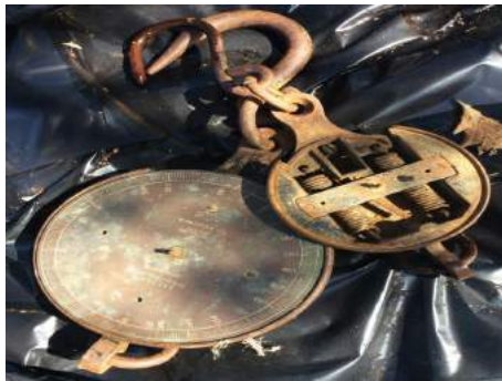
Lot: CLEARING SALE ITEM | Vintage Scales