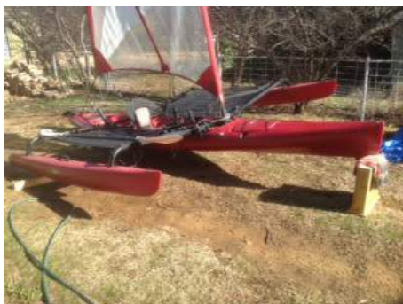
Lot: OUTSIDE ENTRY | P & H. HIGGINS Hobie Mirage Adventure Island Kayak (image 2)