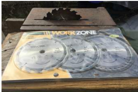
Lot: CLEARING SALE ITEM | Table Saw