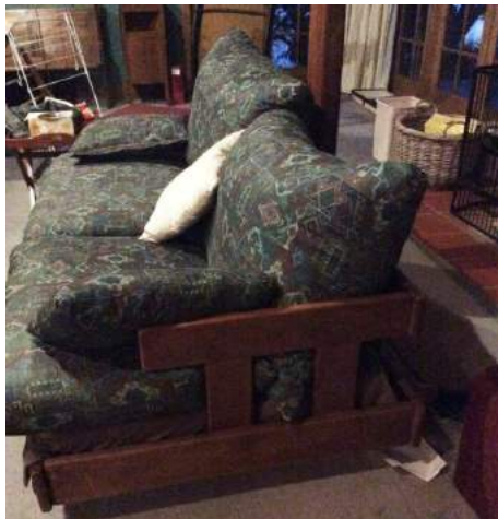
Lot: CLEARING SALE ITEM | Timber Sofa Bed Frame (Single)