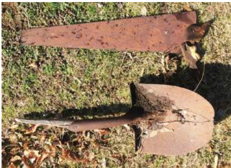
Lot: CLEARING SALE ITEM |