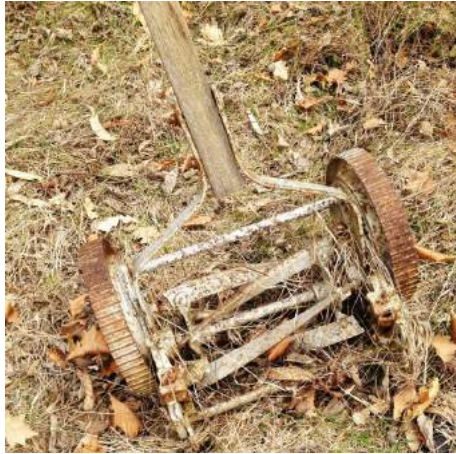
Lot: CLEARING SALE ITEM |