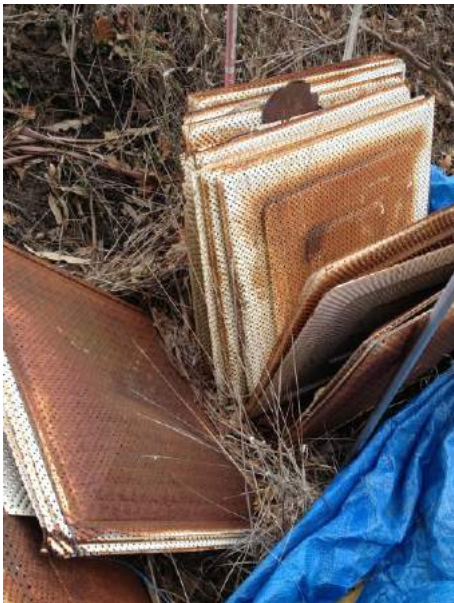
Lot: CLEARING SALE ITEM |