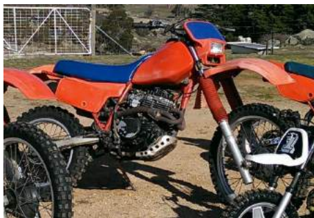
Lot: OUTSIDE ENTRY | MACPHERSON 1983 Honda XR350 (reconditioned head + new valves + need carbies to complete)