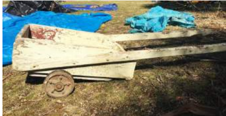
Lot: CLEARING SALE ITEM |