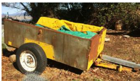
Lot: CLEARING SALE ITEM | Trailer