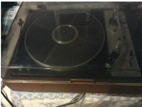
Lot: CLEARING SALE ITEM | Turn-table