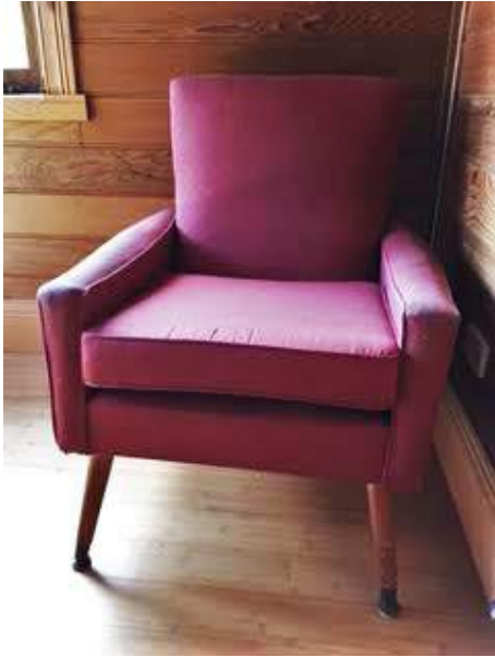
Lot: OUTSIDE ENTRY | MCFARLAND Fabric Armchair (Red/Burgandy)