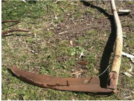
Lot: CLEARING SALE ITEM | Scythe