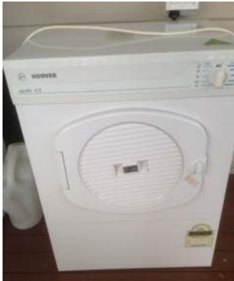
Lot: OUTSIDE ENTRY | P & H. HIGGINS Hoover Clothes Dryer (4kg)