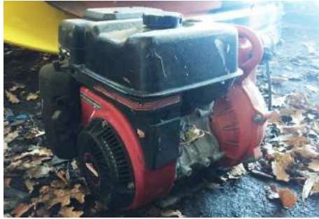
Lot: CLEARING SALE ITEM | Davey Fire Pump Bricks & Stratton motor