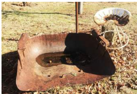
Lot: CLEARING SALE ITEM | Mining Shovel