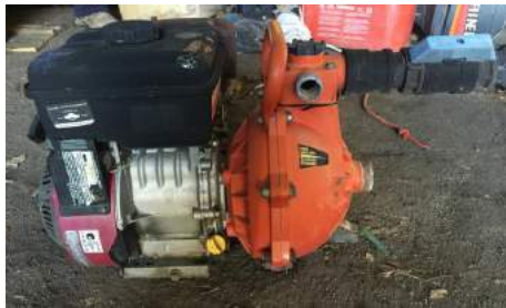
Lot: CLEARING SALE ITEM | Davey Fire Pump Twin impeller + 6hp