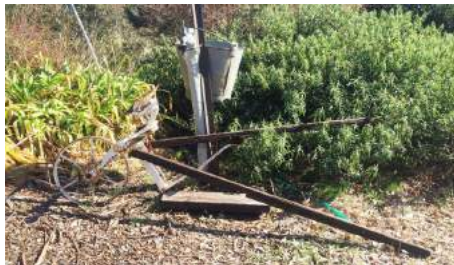
Lot: CLEARING SALE ITEM | Antique Farm Machinery