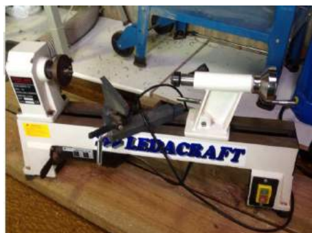
Lot: OUTSIDE ENTRY | P & H. HIGGINS Lathe