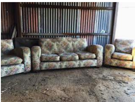
Lot: OUTSIDE ENTRY | MCFARLAND Floral Fabric Single Seater Lounges