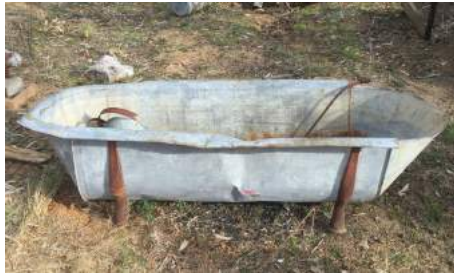
Lot: CLEARING SALE ITEM | Tin Bath