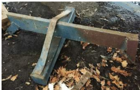
Lot: CLEARING SALE ITEM | Ripper