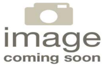
Lot: OUTSIDE ENTRY | E. CONSTANCE Assorted Pianola Scrolls