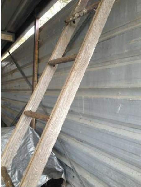
Lot: CLEARING SALE ITEM | Old Timber Ladder