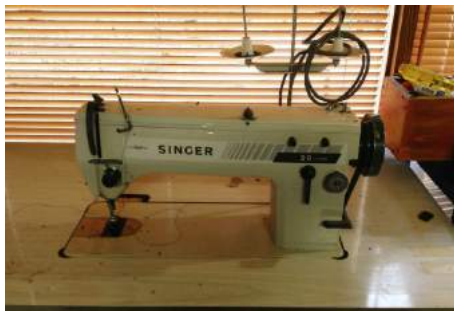
Lot: CLEARING SALE ITEM | Commercial Singer Sewing Machine & Table