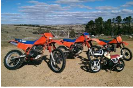
Lot: OUTSIDE ENTRY | MACPHERSON Assorted farm bikes