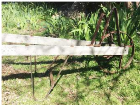
Lot: CLEARING SALE ITEM |