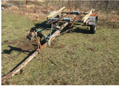
Lot: CLEARING SALE ITEM | Boat Trailer