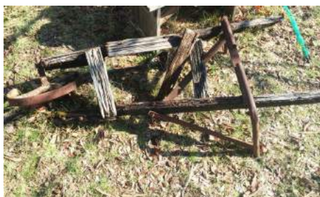
Lot: CLEARING SALE ITEM | Antique Farm Machinery