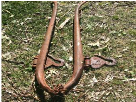
Lot: CLEARING SALE ITEM |