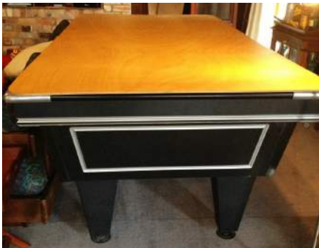
Lot: CLEARING SALE ITEM | Coin Operated Pool Table