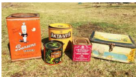
Lot: CLEARING SALE ITEM | Assorted Collectable Tins