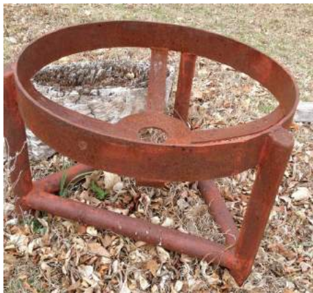
Lot: CLEARING SALE ITEM |