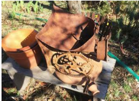
Lot: CLEARING SALE ITEM | Hand Seed Spreader