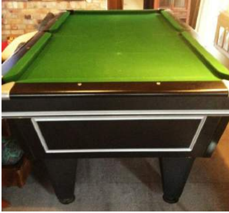
Lot: CLEARING SALE ITEM | Coin Operated Pool Table