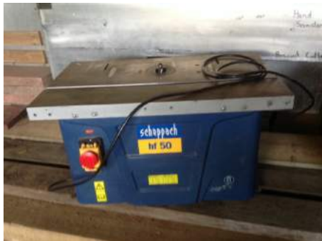
Lot: OUTSIDE ENTRY | P & H. HIGGINS Scheppach HF 50 Benchtop Router