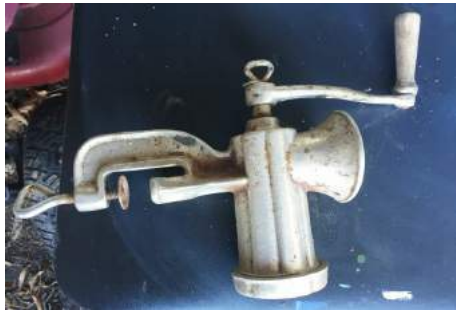
Lot: CLEARING SALE ITEM | Antique Mince Grinder