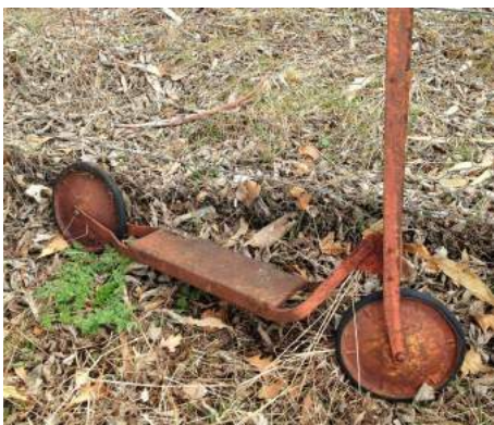
Lot: CLEARING SALE ITEM |