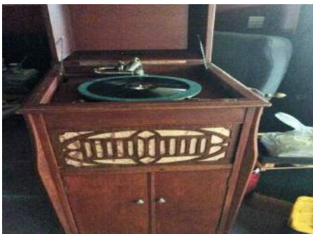
Lot: CLEARING SALE ITEM | Vintage Gramophone In working order