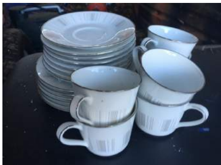
Lot: CLEARING SALE ITEM | Assorted Crockery