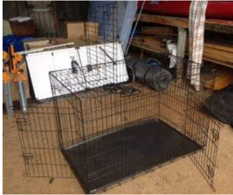
Lot: OUTSIDE ENTRY | P & H. HIGGINS Dog Travelling Cage