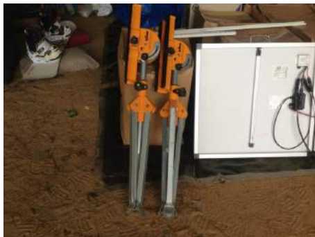
Lot: OUTSIDE ENTRY | P & H. HIGGINS Triton Multi Stand