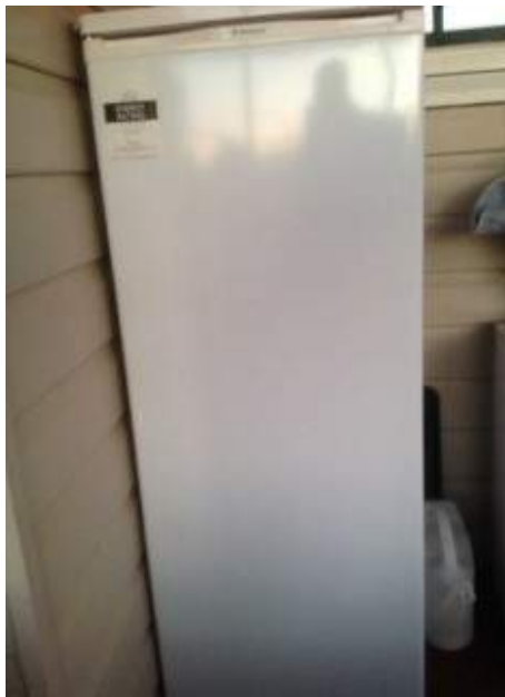
Lot: OUTSIDE ENTRY | P & H. HIGGINS Westinghouse Upright Freezer (image 1)