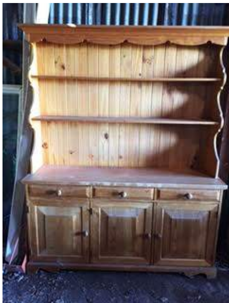
Lot: OUTSIDE ENTRY | MCFARLAND Pine Dresser