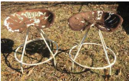
Lot: CLEARING SALE ITEM | Plough Stools