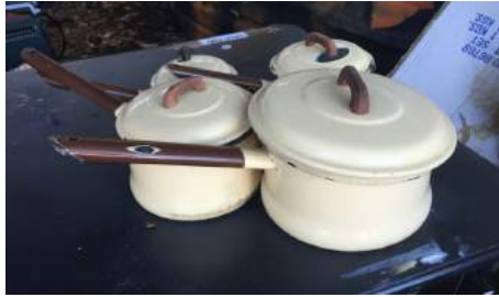
Lot: CLEARING SALE ITEM | Old Saucepans