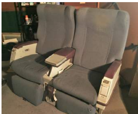
Lot: CLEARING SALE ITEM | Vintage Qantas Airline Seats