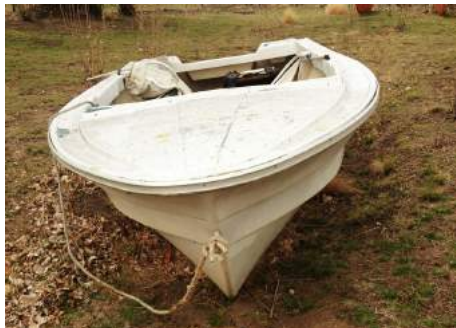
Lot: CLEARING SALE ITEM |