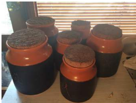
Lot: CLEARING SALE ITEM | Retro Cannisters