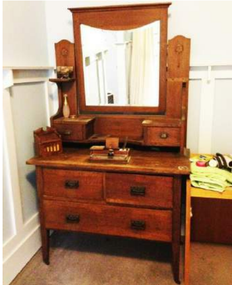
Lot: CLEARING SALE ITEM | Dressing Table