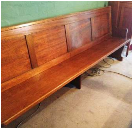
Lot: CLEARING SALE ITEM | Church Pew