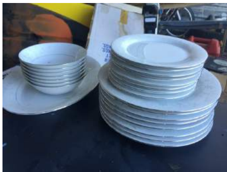
Lot: CLEARING SALE ITEM | Assorted Crockery