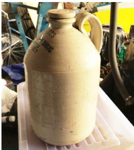
Lot: CLEARING SALE ITEM | Ceramic Jug