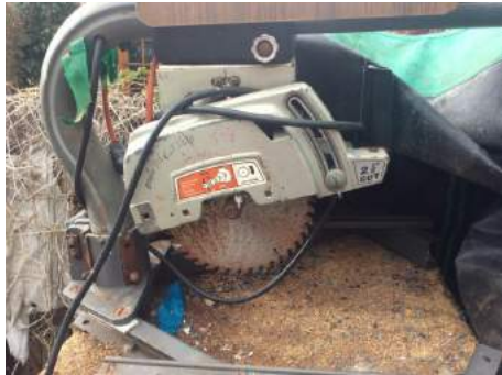
Lot: CLEARING SALE ITEM | Bench Saw