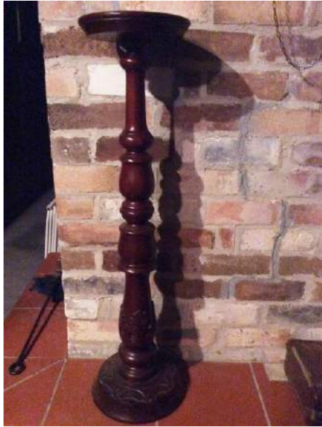
Lot: CLEARING SALE ITEM | Timber Plant Stand