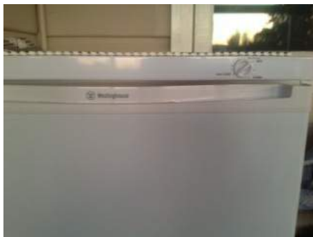
Lot: OUTSIDE ENTRY | P & H. HIGGINS Westinghouse Upright Freezer (image 2)