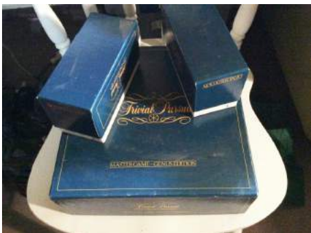
Lot: CLEARING SALE ITEM | Trivial Pursuit Master Edition - Complete Set