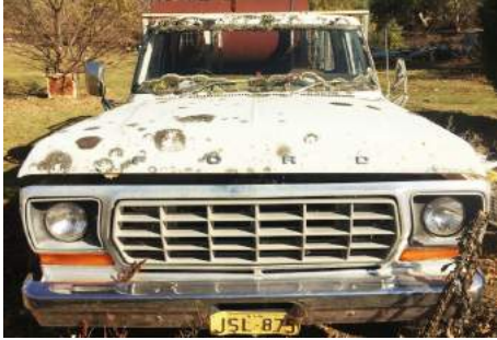
Lot: CLEARING SALE ITEM | Ford F100