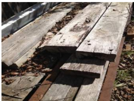
Lot: CLEARING SALE ITEM | Hardwood Slabs