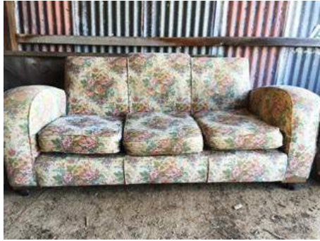
Lot: OUTSIDE ENTRY | MCFARLAND Floral Fabric 3-seater lounge