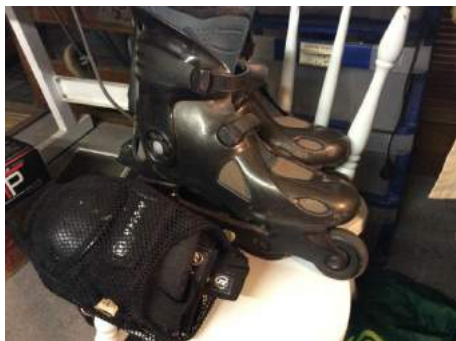
Lot: CLEARING SALE ITEM | Roller Blades & Knee Pads