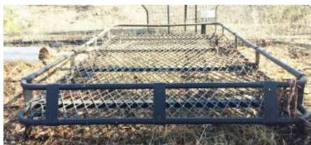
Lot: CLEARING SALE ITEM | Roof Rack/Basket