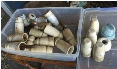
Lot: CLEARING SALE ITEM |