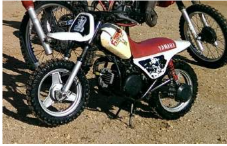
Lot: OUTSIDE ENTRY | MACPHERSON 1981 Yamaha PW50 (inc. training wheels)