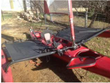
Lot: OUTSIDE ENTRY | P & H. HIGGINS Hobie Mirage Adventure Island Kayak (image 3)