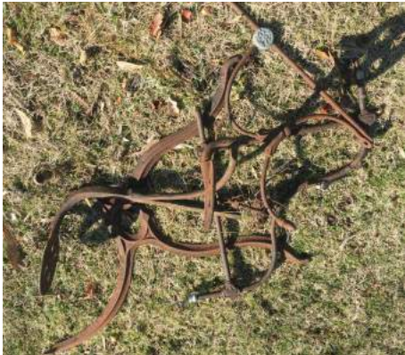
Lot: CLEARING SALE ITEM |