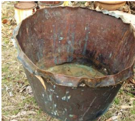
Lot: CLEARING SALE ITEM | Copper