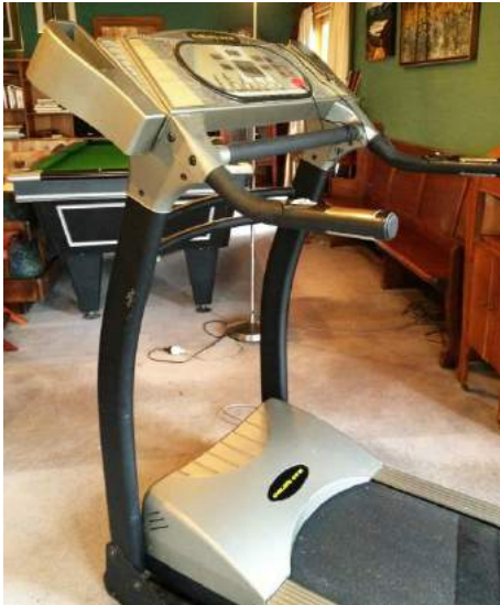
Lot: CLEARING SALE ITEM | Treadmill