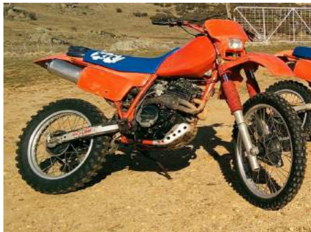
Lot: OUTSIDE ENTRY | MACPHERSON 1983 Honda XR350 (w. custom power pipe)