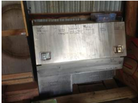
Lot: OUTSIDE ENTRY | P & H. HIGGINS Toolbox