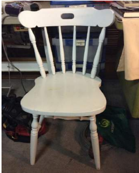
Lot: CLEARING SALE ITEM | White Timber Chair