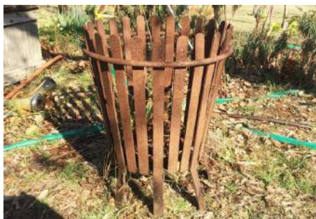
Lot: CLEARING SALE ITEM |