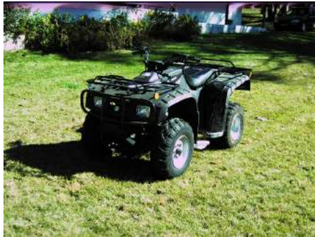
Lot: OUTSIDE ENTRY | R. WHITTAKER Atomix Quad Bike