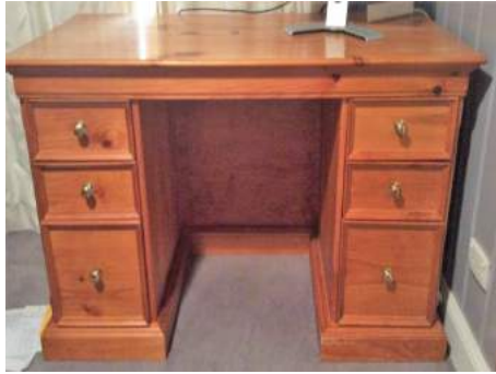
Lot: CLEARING SALE ITEM | Timber Desk