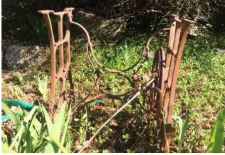
Lot: CLEARING SALE ITEM |