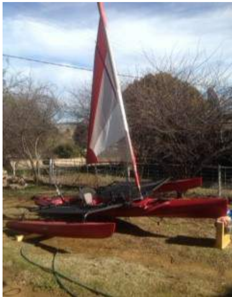
Lot: OUTSIDE ENTRY | P & H. HIGGINS Hobie Mirage Adventure Island Kayak (image 1)