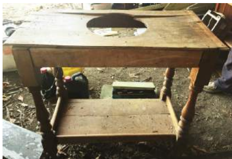
Lot: CLEARING SALE ITEM | Antique Wash Stand