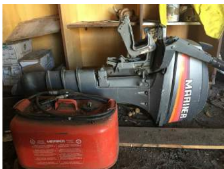
Lot: CLEARING SALE ITEM | Mariner Boat Motor 15hp (in working order)