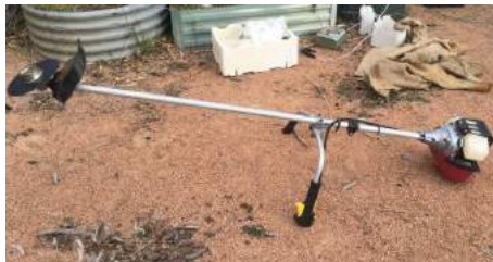
Lot: CLEARING SALE ITEM | Honda Whipper-Snipper