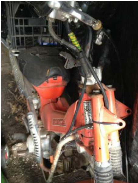
Lot: CLEARING SALE ITEM | Postie Bike