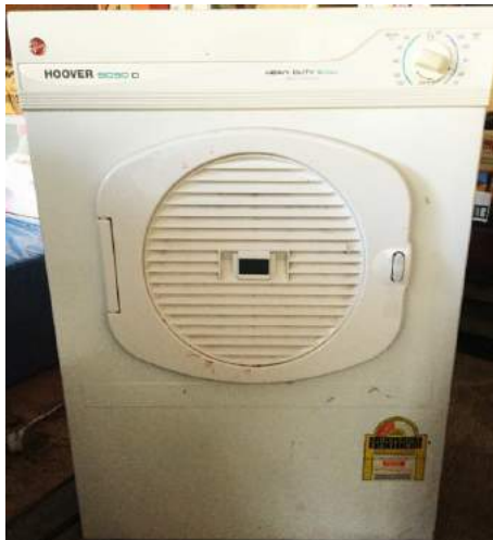
Lot: CLEARING SALE ITEM | Hoover 5030 Heavy Duty Dryer