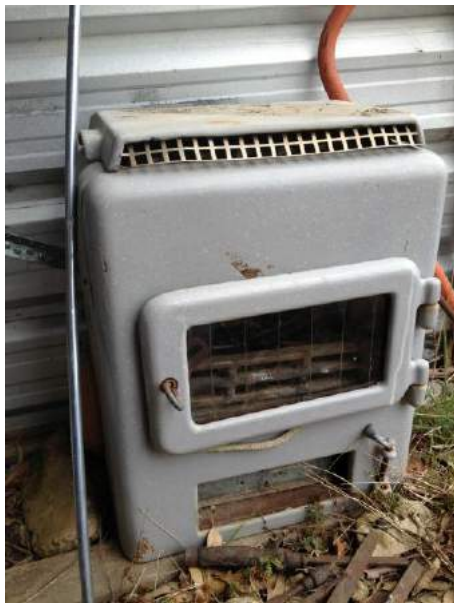
Lot: CLEARING SALE ITEM |